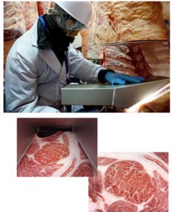
Figure 1 MIJ-30 objective carcase assessment

The AWA has agreements with Meat Image Japan which allow the AWA to be the exclusive reseller of MIJ technology within Australia, New Zealand and South Africa. The AWA will provide training, service support for the cameras locally and provide access to the MIJ cloud-based carcase analysis system for its customers.