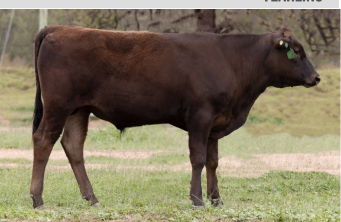
NOTES: Marathon Sanjitomich U0675 boasts the highest genomic marble score of the sale in the top 1% of the breed, as well as an exceptional EMA. Sired by Statkar Sanjitomichi 016H who has passed down his carcase traits.