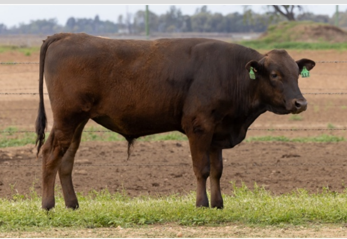
NOTES : Marathon Michifuku U0117 has growth potential to build on any herd. Top 1% mature cow weight EBV; Top 5% for carcase weight, 400 & 600 day weight, plus positive milk and above breed average marbling.

WKSFM0164 WORLD K'S MICHIFUKU SMOFF0154 SUMO CATTLE CO MICHIFUKU F154 SMOFC0016 SUMO CATTLE CO TANI C016 SIRE: MSMFP0011 MARATHON MICHIFUKU P0011 IMUFR3258 TF TERUTANI 40/1 (IMP USA) MCKFX0097 CODENWARRA F X0097 SUMFV2073 SUMO RUKI V2073 MSMF23U0117MARATHON MICHIFUKU U0117 WKSFM0164 WORLD K'S MICHIFUKU SMOFG0002 SUMO CATTLE CO MICHIFUKU G002 CCOFD0220 COATES NAMI D220 DAM: MCKFR3074 CODENWARRA MICHIFUKU R3074 SMOFE0148 SUMO CATTLE CO HIRASHIGETAYASU E148 MCKFM01555 CODENWARRA HIRASHIGETAYASU M01555 MCKFD0350 CODENWARRA F D350