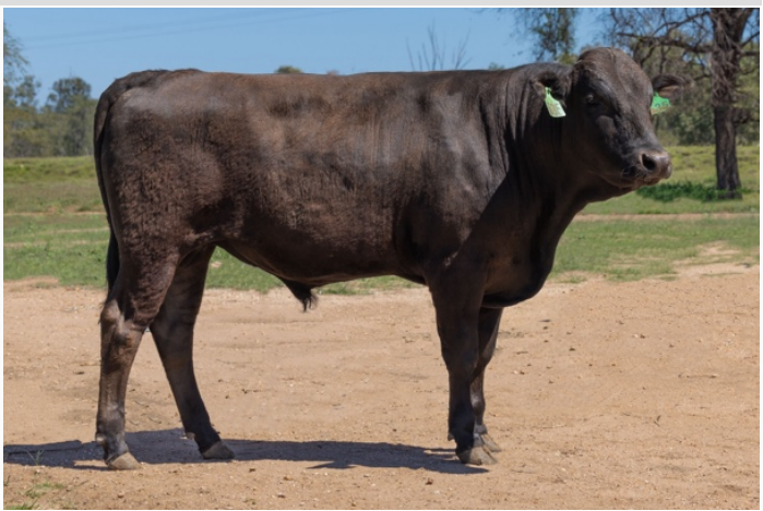
NOTES : Marathon Michifuku U0535 is a nice, balanced young bull with a EMA and genomic marble score in the top 15%. MSMFP0009 has been a exceptional cow in the MW herd due to her excellent phenotype and pedigree.

WKSFM0164 WORLD K'S MICHIFUKU SMOFF0154 SUMO CATTLE CO MICHIFUKU F154 SMOFC0016 SUMO CATTLE CO TANI C016 SIRE: MSMFP0011 MARATHON MICHIFUKU P0011 IMUFR3258 TF TERUTANI 40/1 (IMP USA) MCKFX0097 CODENWARRA F X0097 SUMFV2073 SUMO RUKI V2073 MSMF23U0535MARATHON MICHIFUKU U0535 (COM) WKSFM0164 WORLD K'S MICHIFUKU SMOFF0154 SUMO CATTLE CO MICHIFUKU F154 SMOFC0016 SUMO CATTLE CO TANI C016 DAM: MSMFP0009 MARATHON MICHIFUKU P0009 SMOFE0148 SUMO CATTLE CO HIRASHIGETAYASU E148 MCKFL01295 CODENWARRA HIRASHIGETAYASU L1295 MCKFC0332 CODENWARRA F C332