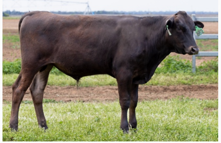
NOTES : Marathon Michifuku U0562 has serious growth traits with 400, 600 and mature cow weight in the top 1%. Use this bull in your breeding program to improve breeder and feeder growth.

WKSFM0164 WORLD K'S MICHIFUKU SMOFF0154 SUMO CATTLE CO MICHIFUKU F154 SMOFC0016 SUMO CATTLE CO TANI C016 SIRE: MSMFP0011 MARATHON MICHIFUKU P0011 IMUFR3258 TF TERUTANI 40/1 (IMP USA) MCKFX0097 CODENWARRA F X0097 SUMFV2073 SUMO RUKI V2073 MSMF23U0562MARATHON MICHIFUKU U0562 IMJFAJ2351 HIRASHIGETAYASU J2351 HONGEN (IMP JAP) SMOFE0148 SUMO CATTLE CO HIRASHIGETAYASU E148 SUMFW1433 SUMO NAMI W1433 DAM: MCKFR3008 CODENWARRA HIRASHIGETAYASU R3008 SMOFD0107 SUMO CATTLE CO SHIKIKAN D107 MCKFM01730 CODENWARRA SHIKIKAN M01730 MCKFJ0810 CODENWARRA 810