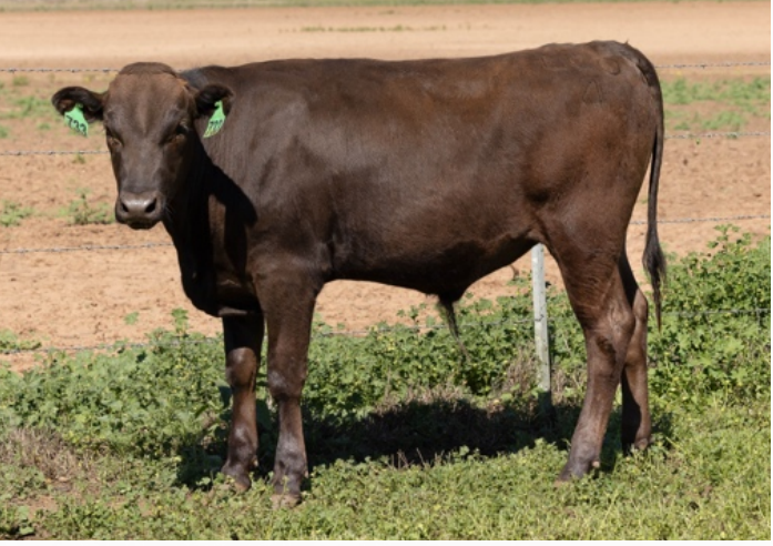
NOTES: Marathon Kanadagene U0733 is a balanced bull with incredible growth traits including mature cow weight and carcase weight EBV's in the top 5%.

DAM: MCKFQ2530 CODENWARRA MICHIFUKU Q2530 MCKFA0165 CODENWARRA F A165 MCKFE0431 CODENWARRA 431 MCKFW0026 CODENWARRA F W0026