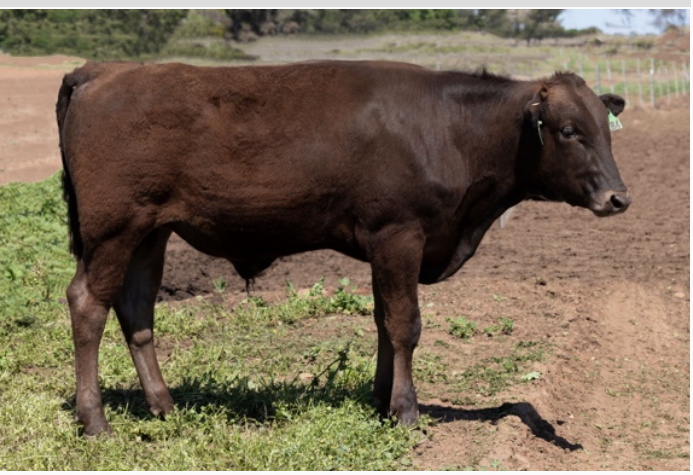
NOTES : Marathon Itoshigenami U0184 (AI) is out of the reputable Trent Bridge Wagyu program. This bull sits in the top 5-10% for growth traits without compromising on carcase quality.

SMOFC0158 SUMO CATTLE CO ITOSHIGENAMI C0158 CCOFG0113 COATES ITOSHIGENAMI G113 CCOFC0446 COATES TANI C446 SIRE: TBRFQ111 TRENT BRIDGE Q111 BDWFY0408 MACQUARIE WAGYU Y408 TBRFN190 TRENT BRIDGE N190 TBRFJ0038 TRENT BRIDGE J38 MSMF23U0184MARATHON ITOSHIGENAMI U0184 (AI) SMOFG0003 SUMO CATTLE CO MICHIFUKU G003 SMOFM0065 SUMO CATTLE CO MICHIFUKU M65 CCOFD0270 COATES NAMI D270 DAM: MCKFS3226 CODENWARRA MICHIFUKU S3226 SMOFE0148 SUMO CATTLE CO HIRASHIGETAYASU E148 MCKFM01563 CODENWARRA HIRASHIGETAYASU M01563 MCKFE0447 CODENWARRA 447